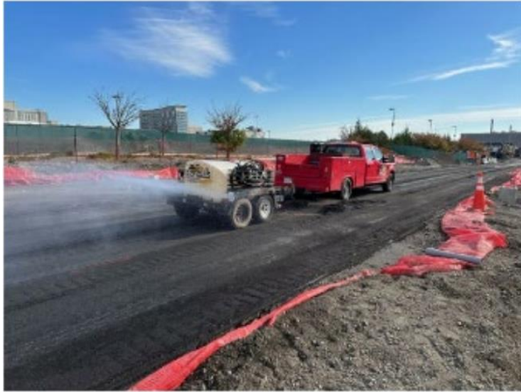
Water misting during milling