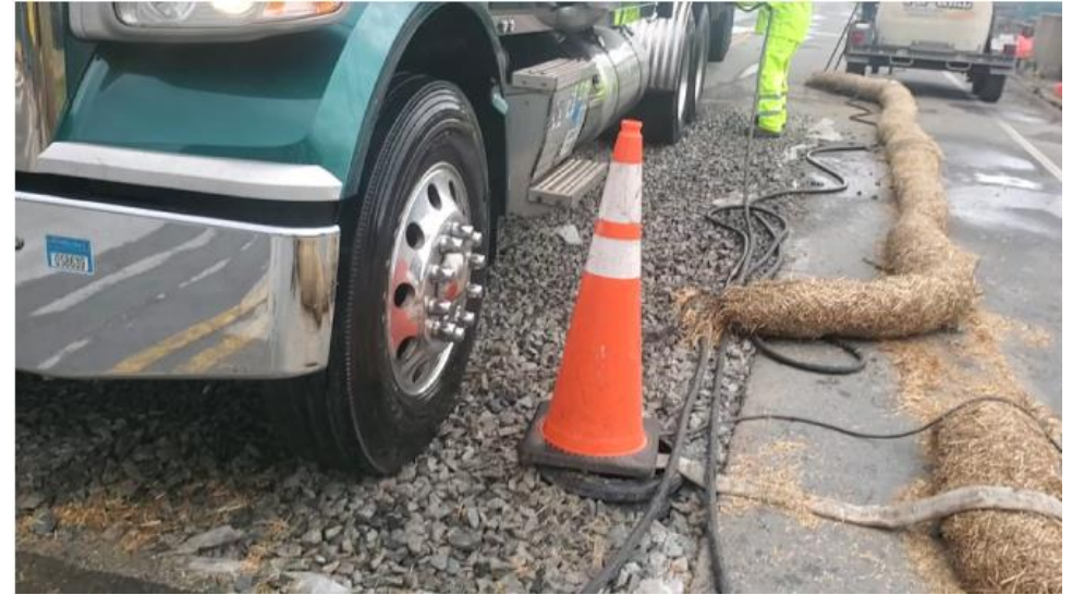
Truck Decontamination – View Video